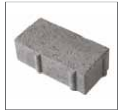
Permeable 4" x 9" Actual Size: 4 5/8" x 9 1/4"

offer 10.6 percent open space to allow water to infiltrate at a rate of 7 to 8 inches per hour. Again, choosing interlocking pavers increases load-bearing capability and choosing a product that can be mechanically installed will save time and reduce costs.