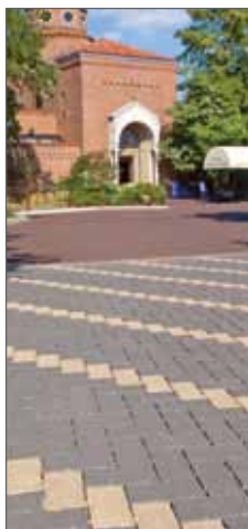
Permeable 4” x 9”